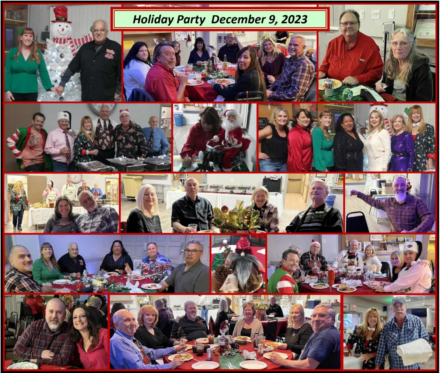
Holiday Party December 9, 2023