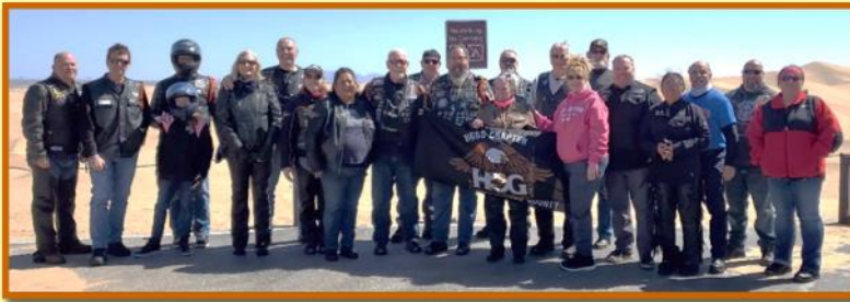
Yuma Overnight Trip March 2023