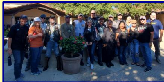
Ronald Reagan Library Overnight Trip October 2023