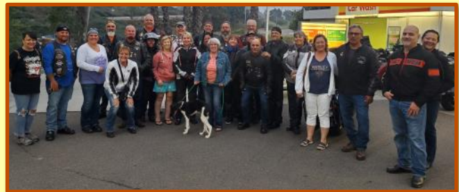
Grand Canyon / Williams, AZ Long Distance Trip September 2023