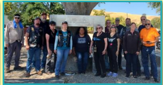
California Coastal Long Distance Trip August 2023