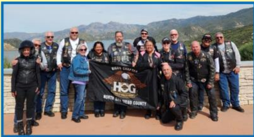
5 Lakes / Big Bear Overnight Trip April 2023