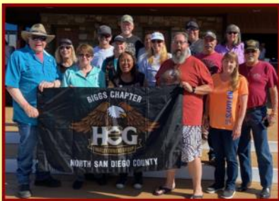
"North Meets South" Rally Reno Long Distance Trip June 2023