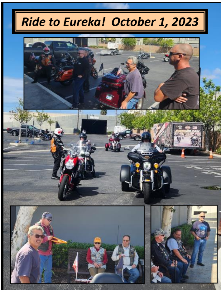
Ride to Eureka! October 1, 2023